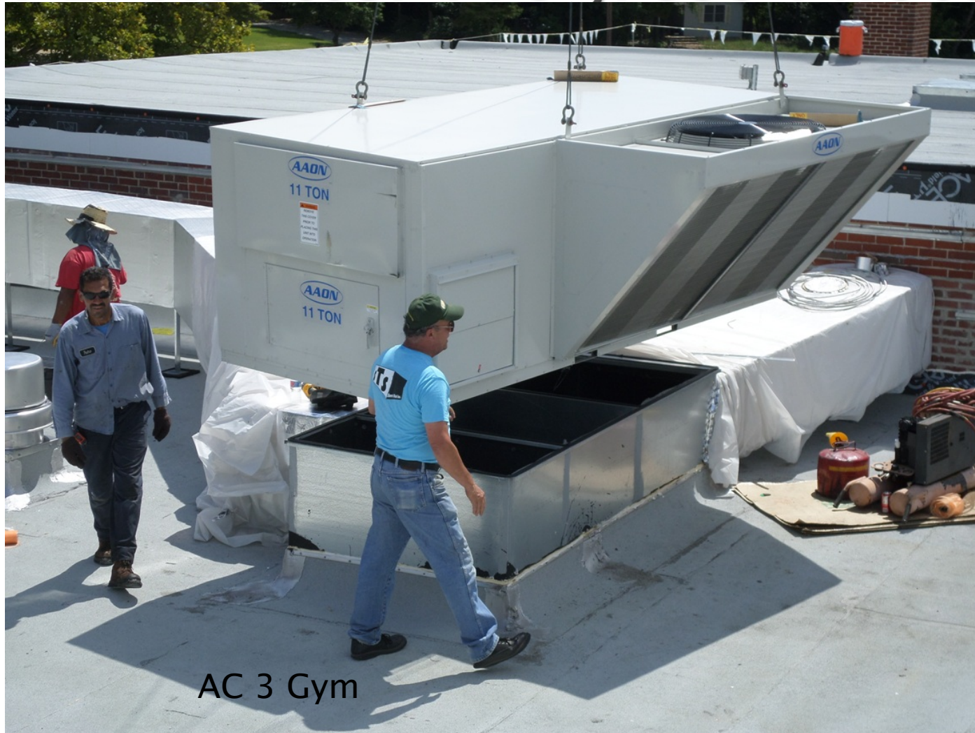
AC 3 Gym