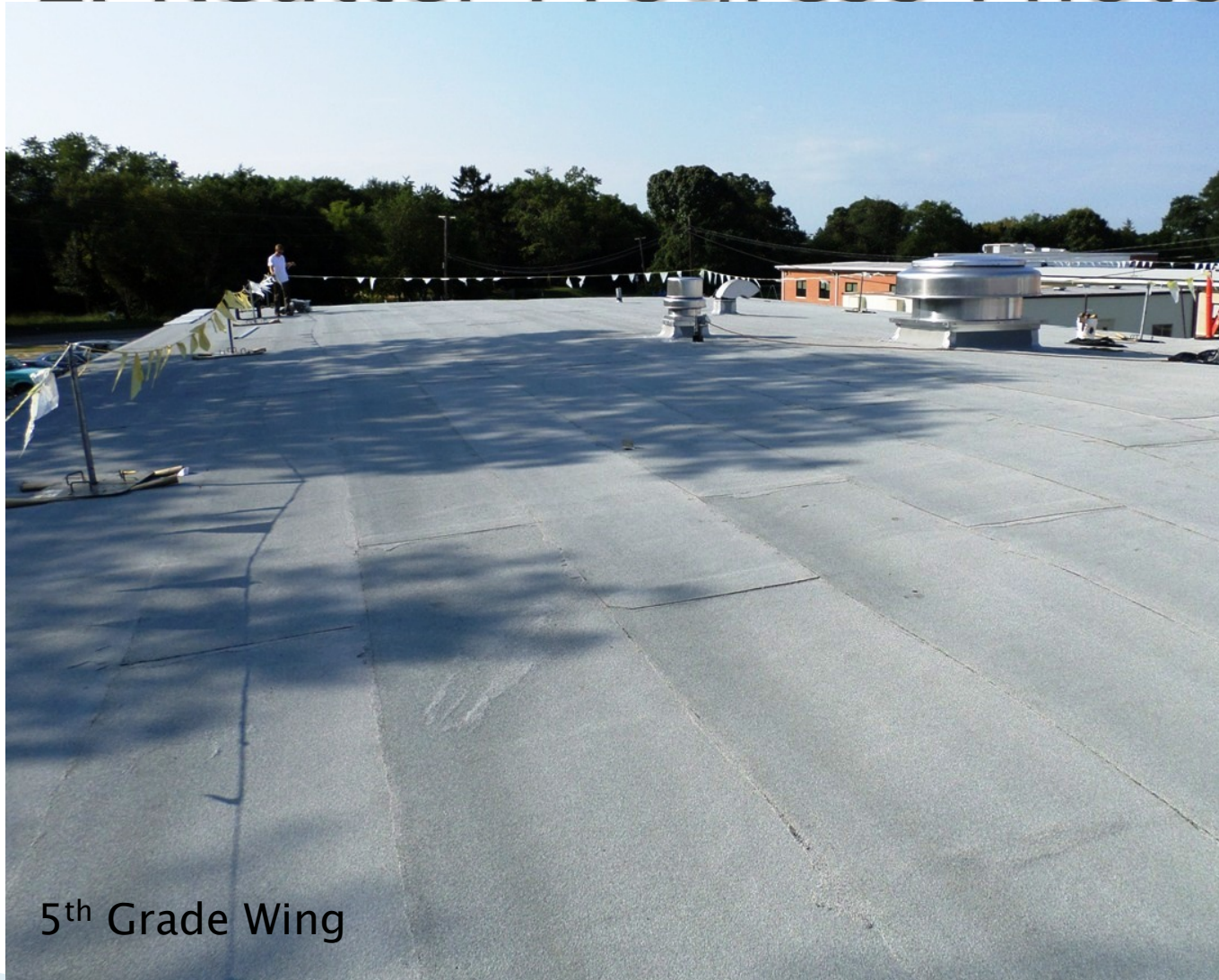
5 th Grade Wing