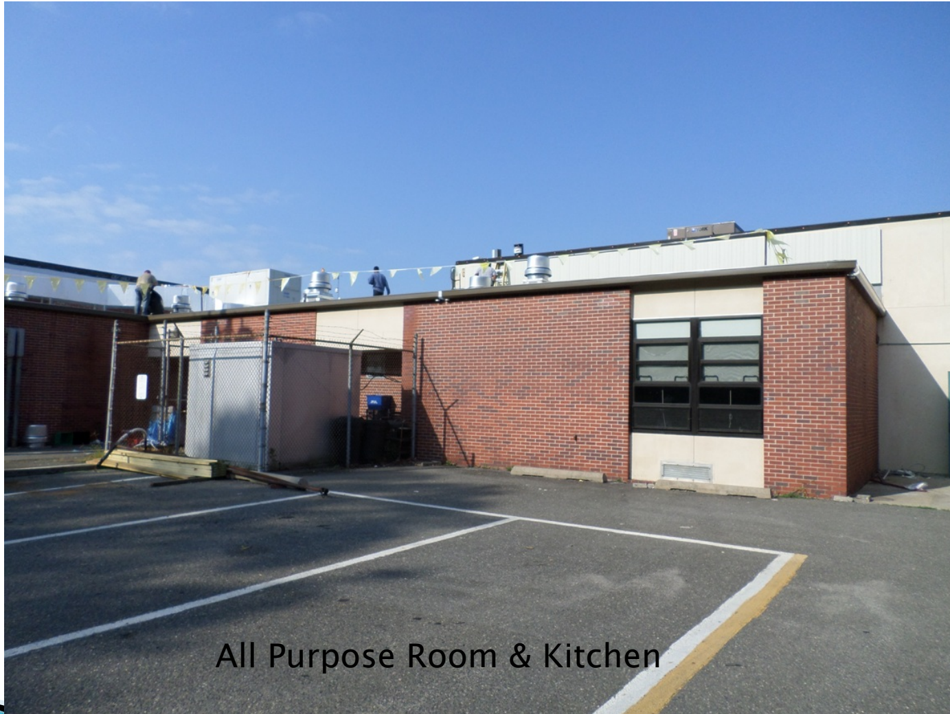
All Purpose Room & Kitchen