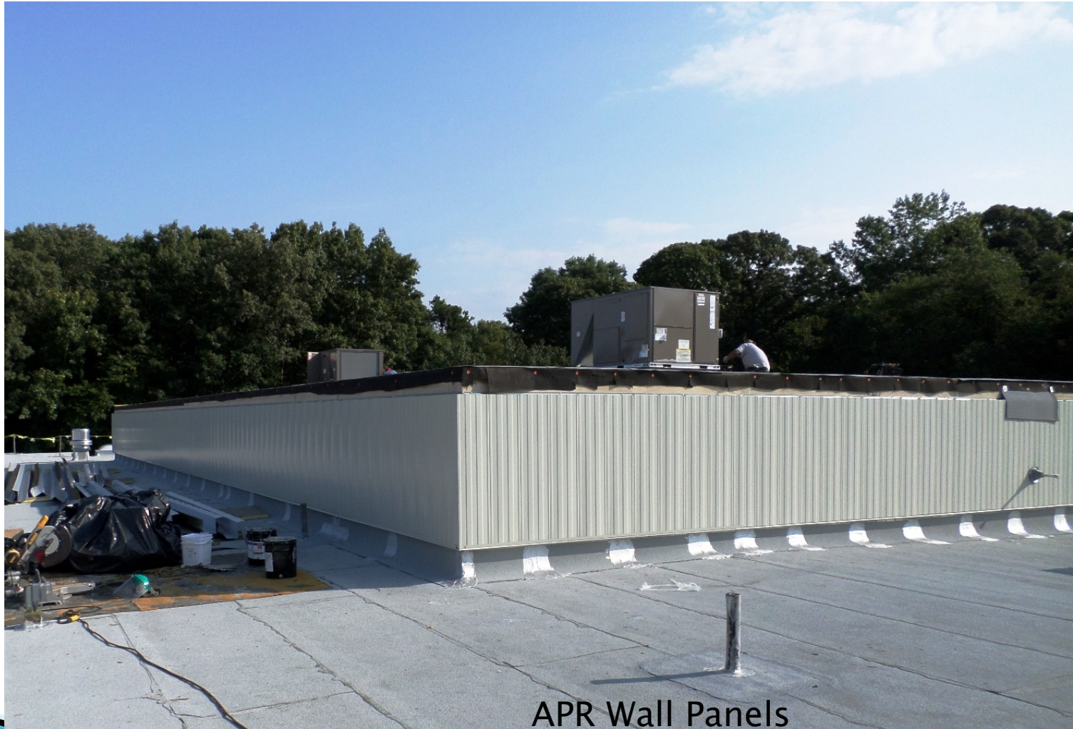
APR Wall Panels